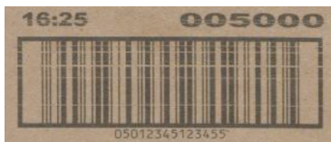
Printer cleaner off