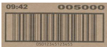
Printer cleaner on